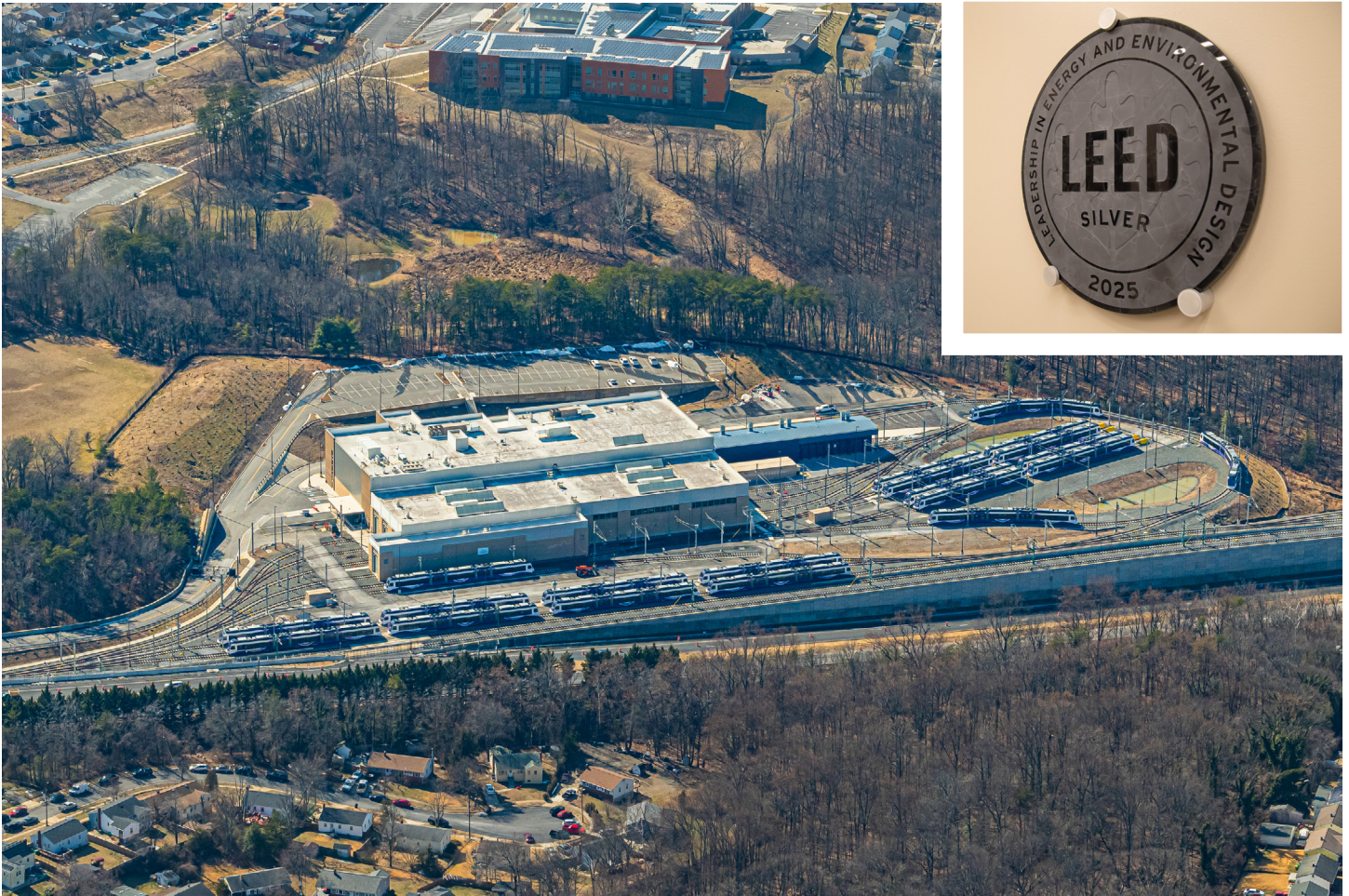
Overhead shot of OMF, Photo of LEED plaque.

Thank you for subscribing to the Purple Line newsletter.